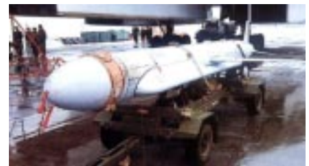
(below) India has licenced the supersonic ramjet Kh-61 Yakhont as the Brahmos. (NIC)