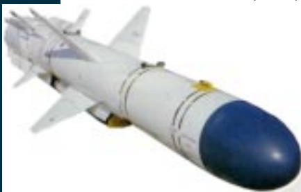
(above) Kh-35U Uran/Kharpunski. (below) The ramjet Kh-31R/MR/A/MA family includes anti-radiation, anti- shipping and anti-AWACS variants.