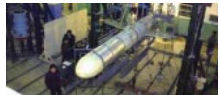
A rare image of a prototype Chinese strategic land attack cruise missile (above), bearing a remarkable resemblance to the Tomahawk. Many reports claim China acquired a pair of failed Tomahawks from al-Qaeda after the 1998 US strike. Recent reports also claim China acquired tooling and engineering data for the Russian Kh-65SE ALCM, depicted (below) the longer ranging Kh-55M variant of this missile.