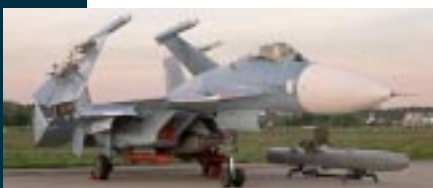
NPO Mashinostroyeniya Kh-61 Yakont (Su-33)