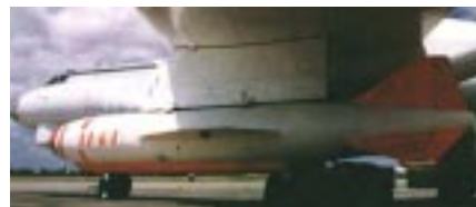
C-601 (above) and (below) C-801K (PLA)