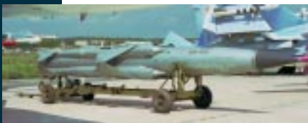
Air launched Kh-41 Moskit.