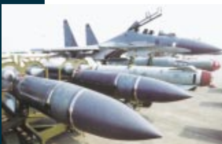
Su-30MKK with Kh-31R, Kh-59M and KAB-1500Kr. (KNAAPO)